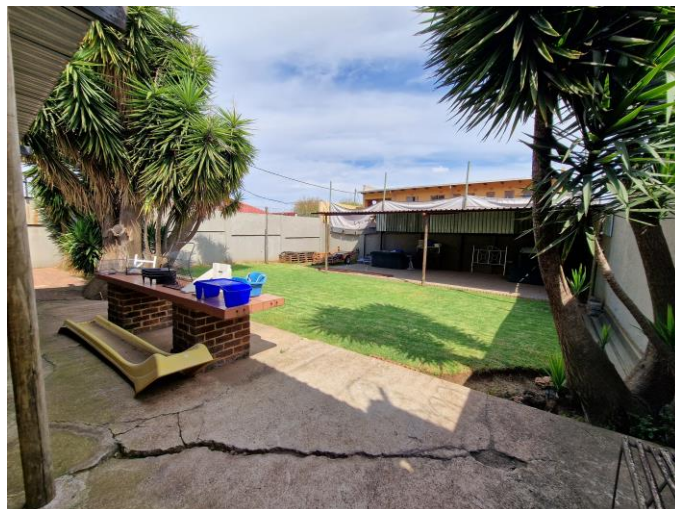
Photos – Carport & Garages