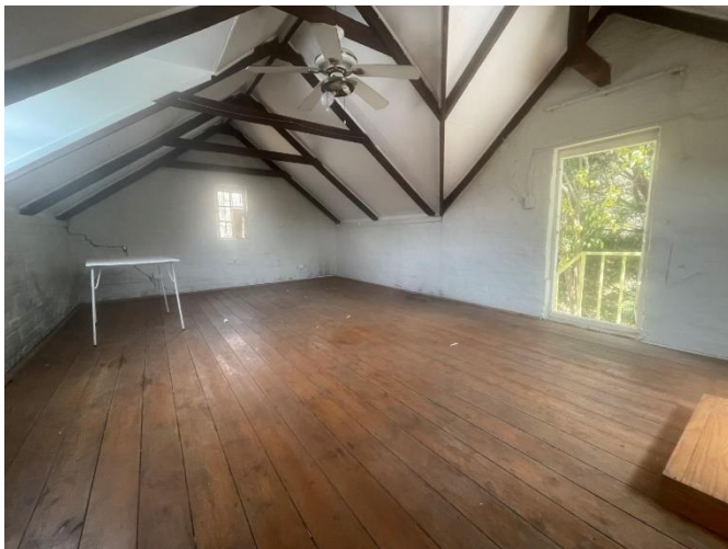
Photos – Outside Office / Storeroom