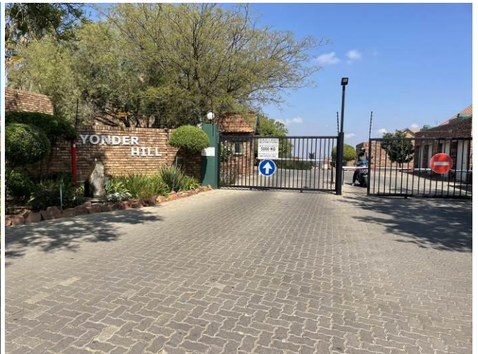
Photos – Communal Area