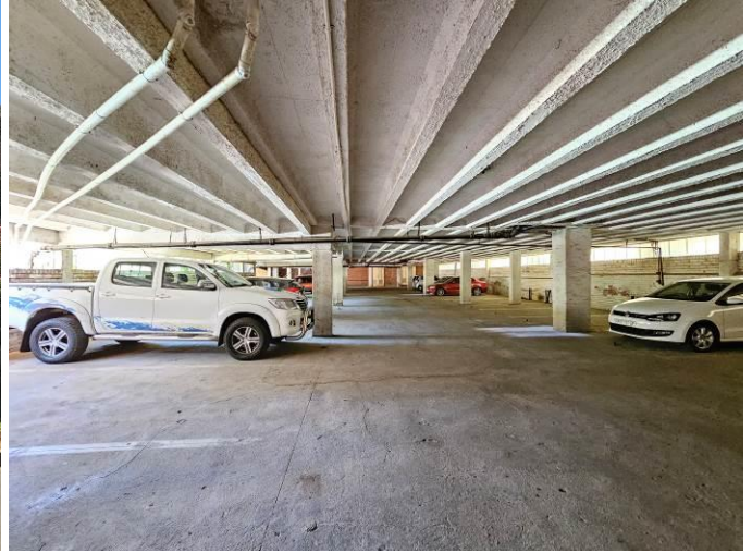
Photos – Communal Area