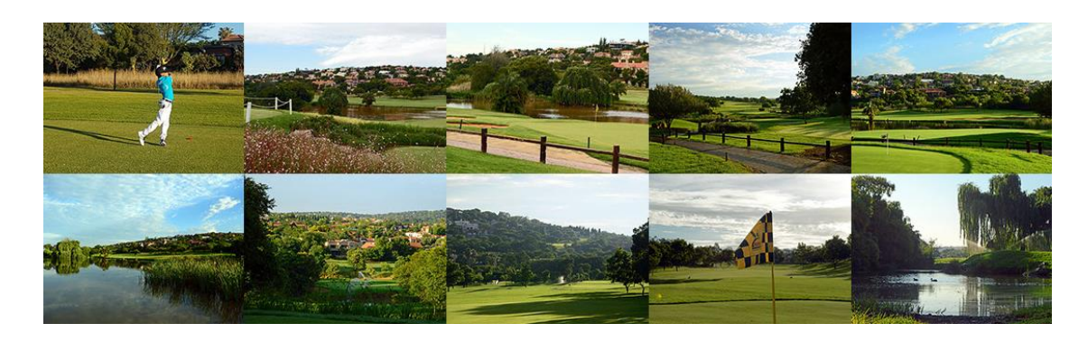
Conferencing with a magnificent view!

Woodhill Residential Estate and Country Club ranks amongst the top 100 most prestigious golf courses in South Africa.