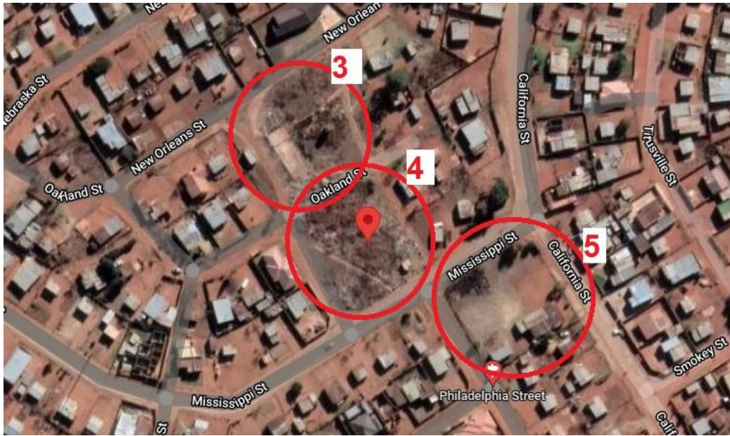
Photos – STAND 3